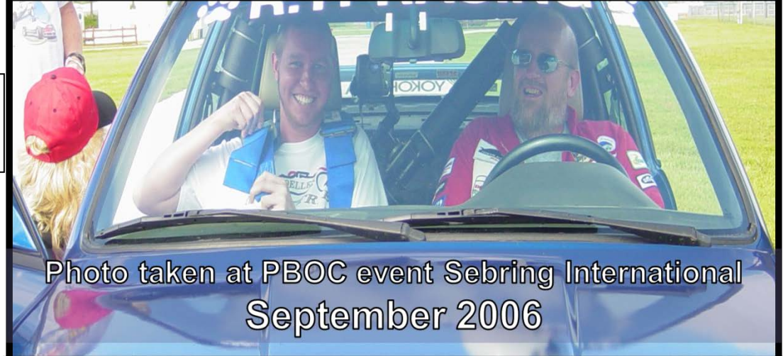
Photo taken at PBOC event Sebring International September 2006

To give this opportunity to a youth is priceless, 6 weeks before we loose them is indescribable.